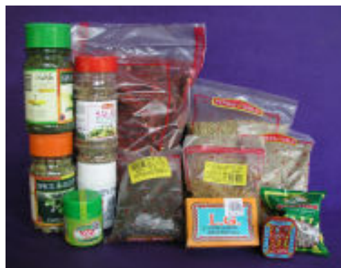
Fig. 12.1. Functional packages for whole spices

The importing countries insist more on bulk packages and the packaging requirements of whole dried spices are not very stringent. Unit packages are coming into use gradually in the country. Most people buy whole spices in loose. Packaged spices are mostly sold only in cities where super bazars are established. Whole spices are packed in 50 g to 1 kg units in 50–70 \mu\text{m} polyolefin pouches. Few brands are packed in PET/PE laminate for good printability. Considerable amount of green and red pepper is exported in A 2½, A1 tall or 5 oz baby tin containers in 2% brine solution or as pickles and they are also packed in glass containers. Dehydrated green and red pepper with a moisture content of 3–4% (ERH 20–30%), which are very sensitive to oxidative changes like bleaching of colour especially in presence of light, needs good protection against moisture, oxygen and light. They can be stored only for short term in polyolefin pouches and need metallized PET/PE or Al foil laminate for longer storage periods as consumer unit packs. HDPE containers for asafoetida, glass bottles for cardamom and for few herbal spices are also available.