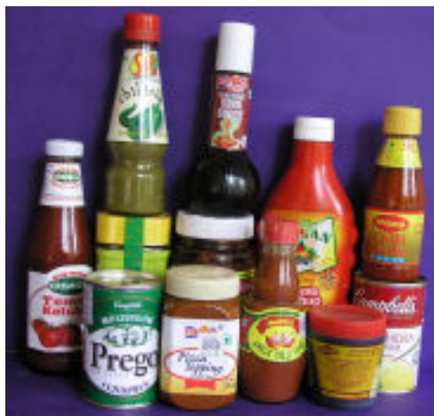
Fig. 12.4. Unit packs for masala pastes, sauces, salad dresses, etc.

Sauces are the first foods to be packed in plastic bottles. They were being repacked in squeeze bottle for convenience after initial purchasing in metal cans or glass bottles. Even though retail packs in PE bottles are in use, slight deterioration occurs with very strong flavours. However, co-extruded LD/Tie/EVOH/Tie/PE blow moulded bottle was found to offer good shelf life. PET/EVOH, PET/EVOH/PET constructions, although little expensive, are being used for ketchup. For salad dressing which contains oil, vinegar and other ingredients along with spices, PET bottles are preferred to EVOH constructions or PP/HDPE containers. Smaller size pouches (single use) are also popular for salad dressings. As these pouches have considerable surface to volume ratio, a high barrier material like foil laminate, sealant layer being EAA or