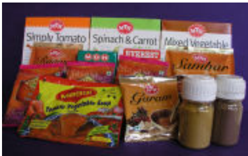
Fig. 12.3. Unit packs for dry spice mixes

for internal market and glass/PET jars for export market are being used for the packaging of these pastes.